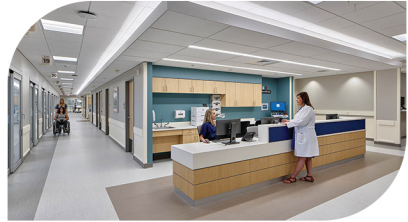
Hospitals - Clinics