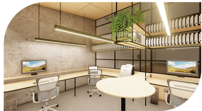
Offices - Showroom