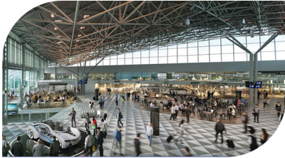
Airport - Stations