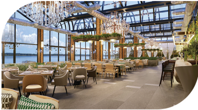
Hotel - Restaurants